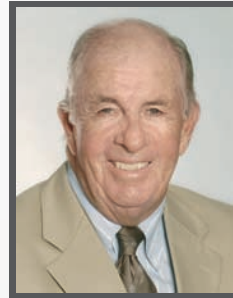
Rod McLeod, Q.C.

Formerly Attorney General of Ontario and Minister Responsible for Native Issues 1995-99, MPP Willowdale 1990-99; 20 years in Private Law Practice and 7 years in Government Relations Practice.